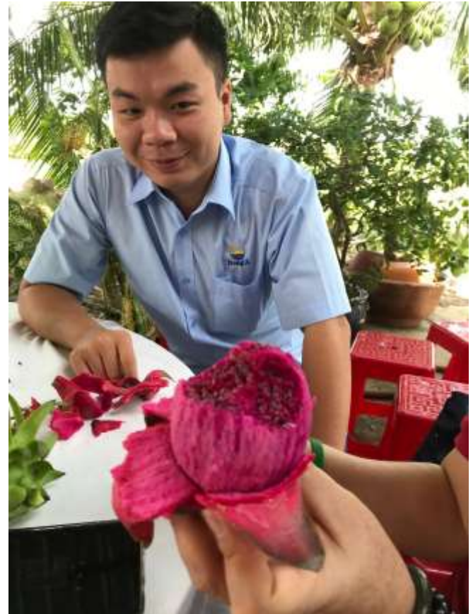
Red dragon fruit – grows well with Seasol !