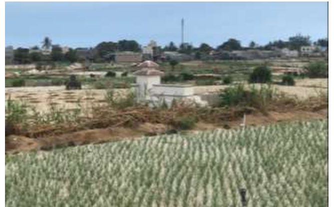
Garlic Ly Son Island