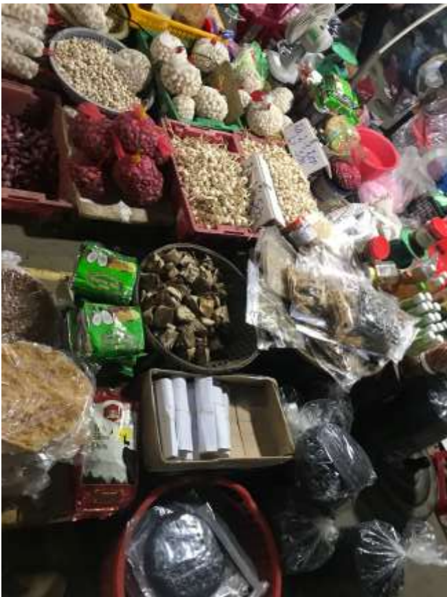
Market Ly Son Island.