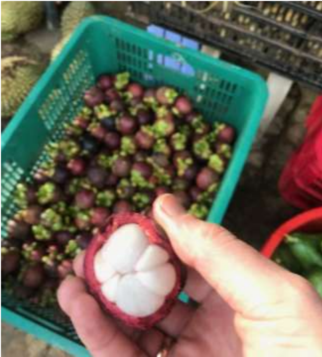
What fruit is that?