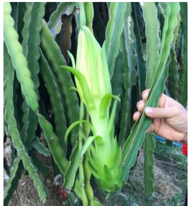
Dragon fruit flower – the fruit forms at the base of the flower.