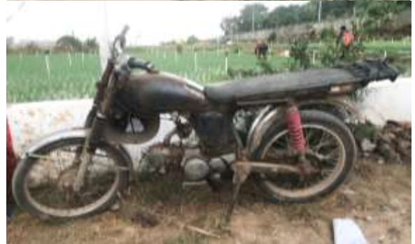
A couple of bikes for Hein's collection.