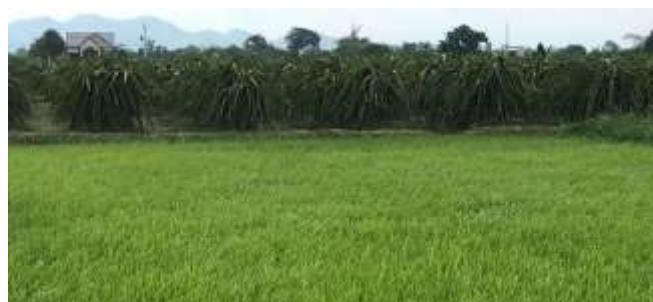
Typical farm with rice and dragon fruit fields.

Vietnam is a major producer and exporter of dragon fruit with around 40,000 hectares under production in the south and south east of the country.