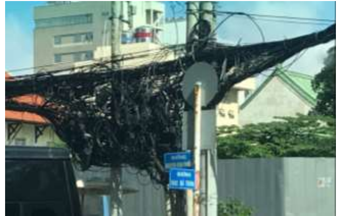
Ho Chi Minh has the NBN?!